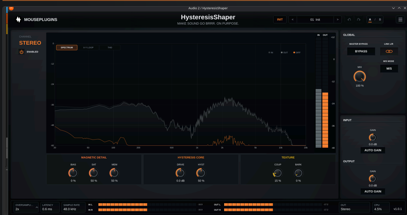
FIG. 3 - LINKED STEREO LANE. THE HYSTERESIS CHART SITS ABOVE THREE KNOB GROUPS: MAGNETIC DETAIL, HYSTERESIS CORE, TEXTURE.

Each lane has, top to bottom: the hysteresis chart (loop + spectrum behind it), then a row of three coloured panels - MAGNETIC DETAIL (golden in linked Stereo), HYSTERESIS CORE (orange), and TEXTURE (coral). A power button at the top-left labels the lane and bypasses just that lane (the other one keeps processing). In linked Stereo there is one lane filling the area; with LINK off there are two, stacked vertically.