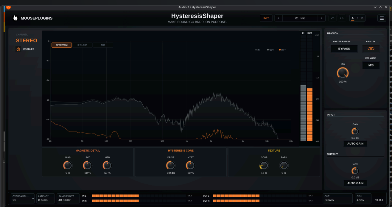
FIG. 1 - HYSTERESSHAPER IN LINKED STEREO (LINK L/R ON). THE TWO LANES ARE COLLAPSED INTO A SINGLE STEREO LANE.